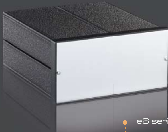
● e6 series