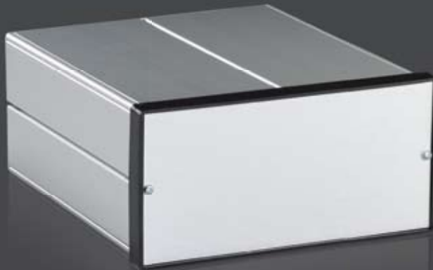
● e7 series