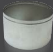
deep round straight edge