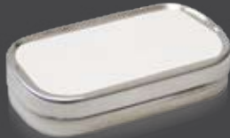
oblong with paper lid