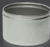
deep round rolled safety edge