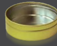
flat round rolled safety edge