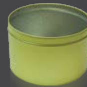
oblong with plain lid