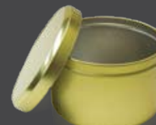
deep round / rolled safety edge plain lid / straight edge