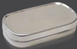
oblong with plain lid