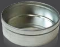
flat round rolled safety edge