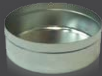
flat round straight edge