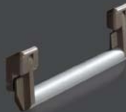
● swing-type handle