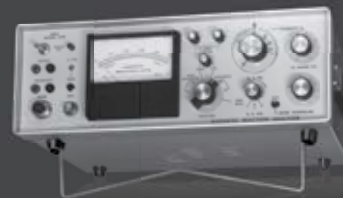
● fold away bail