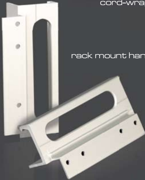
rack mount handles