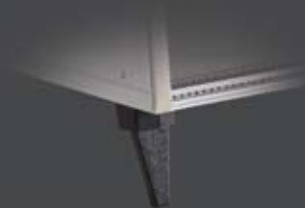
● flip foot